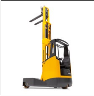
Jungheinrich masts lift loads at height