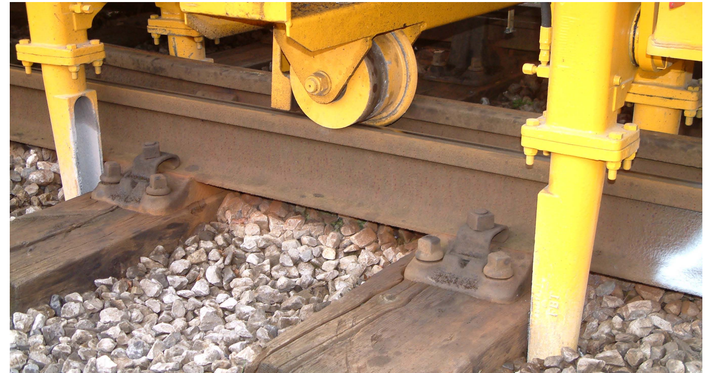
Multipurpose Stoneblower injecting stone under sleepers to lift track.