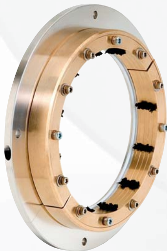
Inpro/Seal® Multi-Stage CDR® for high voltage systems.

Technology you can rely on, supported by customer service you'll appreciate.