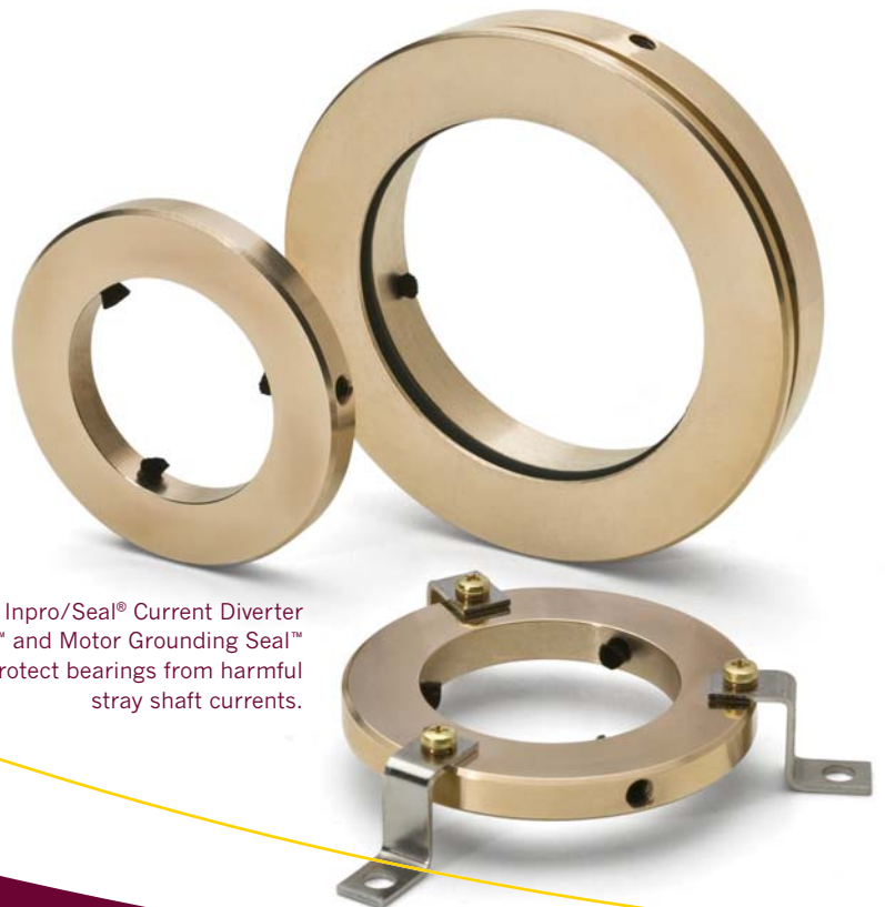
The Inpro/Seal® Current Diverter Ring™ and Motor Grounding Seal™ protect bearings from harmful stray shaft currents.

Diverting shaft currents and controlling EDM needs to be a priority for your business. Various methods have been used over the years to mitigate shaft currents, but they have all had limitations...until now.