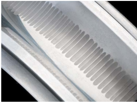
Stray shaft currents discharging through the bearings on rotating equipment can cause fluting on the bearing race, resulting in premature bearing failure.

VFDs induce high frequency voltages on the shaft that seek a path to ground through the motor's bearings or the bearings of the coupled equipment. When these voltages exceed the insulation breakdown of the lubricant, they discharge through the bearings to ground.